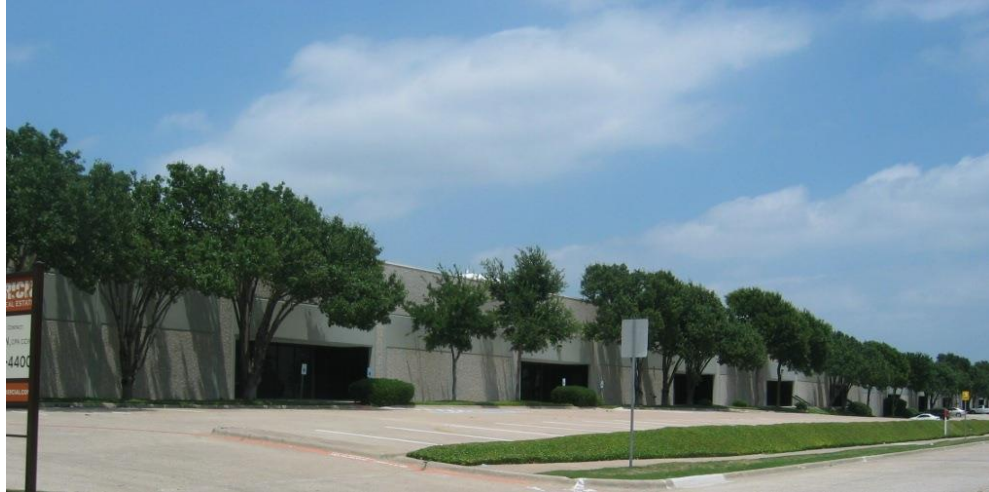
Palisades Industrial III