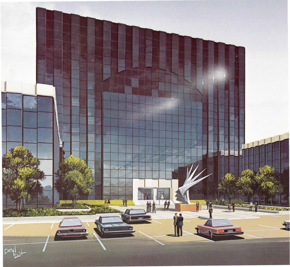
Pitman Atrium Tower, Plano, TX