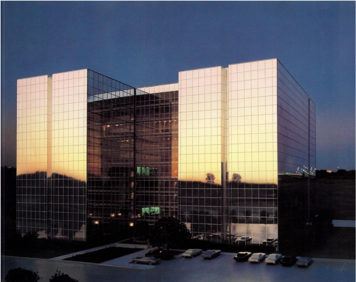
One Lakeview Energy Center, Oklahoma City, OK