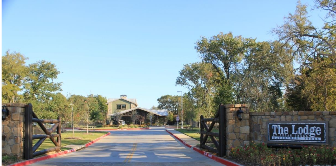
The Lodge at Pecan Creek