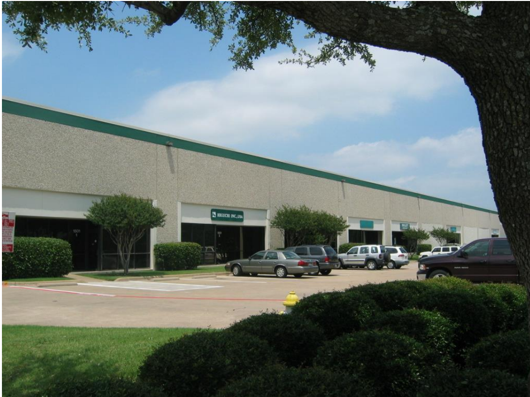
Palisades Industrial II