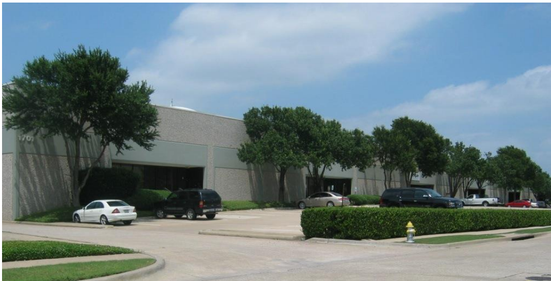
Palisades Industrial IV